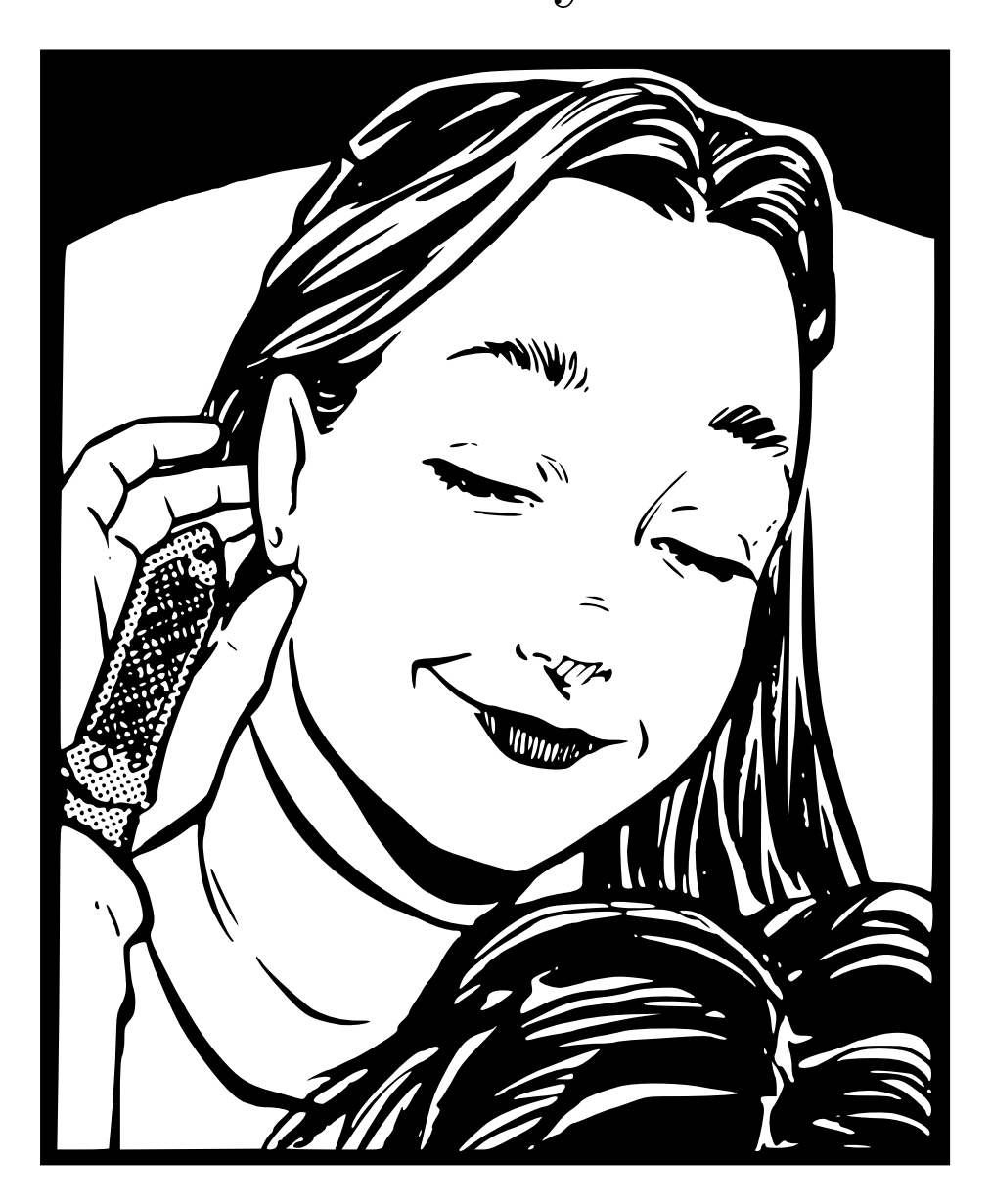
A Critical Analysis of Rape Culture in Anarchist Subcultures